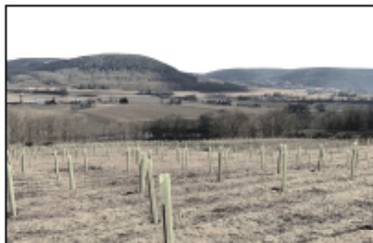
Above: The district planted this upland area in 2014 to kickstart the natural regeneration of an old hay field.

The purpose of the Establishing Large Forests grant program (ELF) is to provide state financial support to establish new forest areas by reimburses expenses for site preparation, tree planting, deer protection practices, monitoring and maintenance activities on non-industrial private lands.