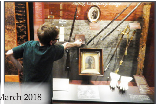
4-H trip to the Gettysburg Battlefield in March 2018