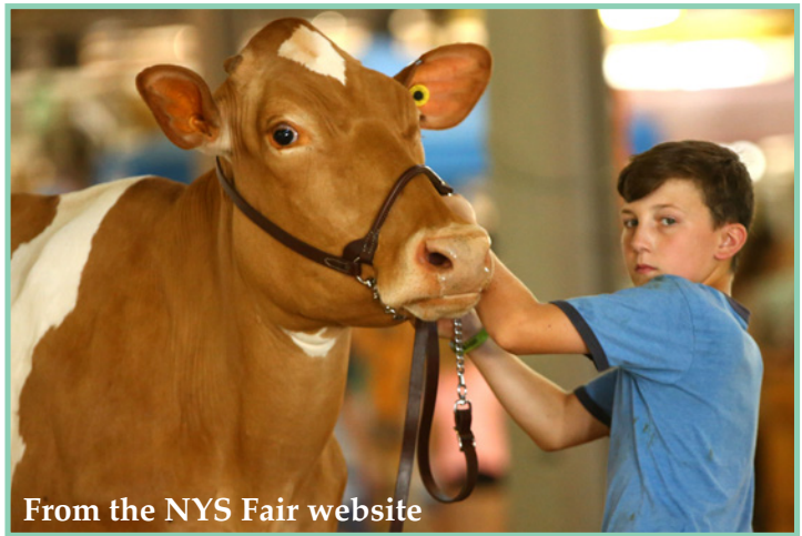
From the NYS Fair website

Chenango County – 8 th Novice, 13 th Junior Dairy Goat Judging Teams; 4 th Jr, 3 rd Sr Dairy Goat Bowl Teams; 1 st Jr and Sr and 3 rd Sr Goat Fitting Competition